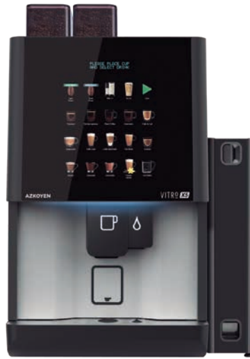
External EXE/MDB payment module