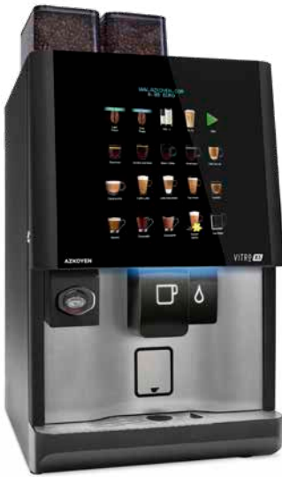
Cashless system integration option

The machine is compatible with Pay4Vend App, allowing payment directly from a mobile phone.