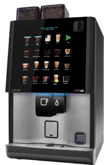
EXE/MDB change giver integration option