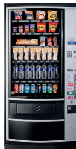
Palma+ H87 XtraDrinks

AZKOYEN S.A. reserves the right to alter this specification without prior notice, result of technical improvements resulting from its ongoing research.